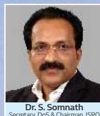
Dr. S. Somnath Secretary, DoS & Chairman, ISRO