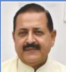
Dr. Jitendra Singh MOS (I/C) M/O S&T & M/o ES Chief Patron