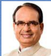
Sh. Shivraj Singh Chauhan Chief Minister of MP Chief Patron